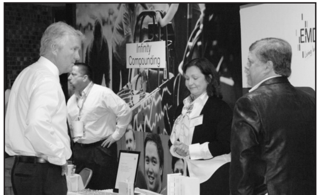
MiniTec attendees visit one of the 7 tabletop displays