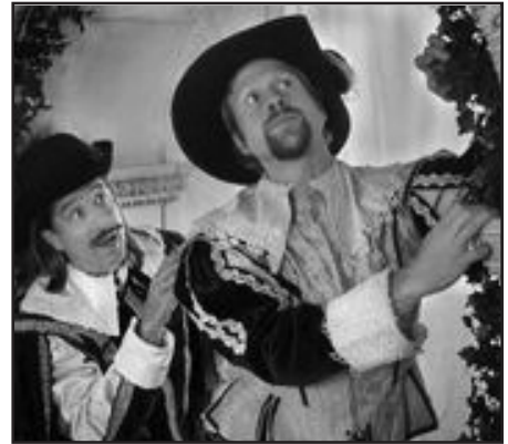
Everyone enjoyed the Park Square Theatre's presentation of Cyrano.