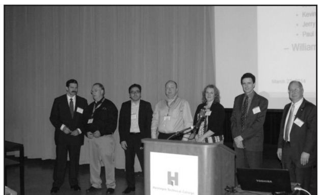
Seven of the presenters at the 2014 Medical MiniTec