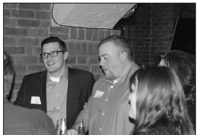
Guests enjoyed the social hour at the Embassy Suites prior to the awards presentation