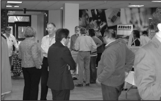
Attendees network at the 2014 Medical MiniTec