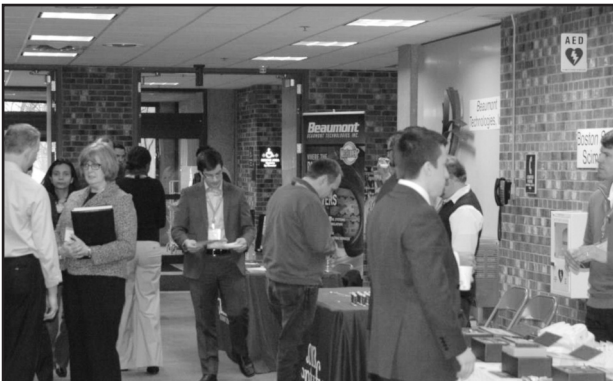
Networking continues during a break